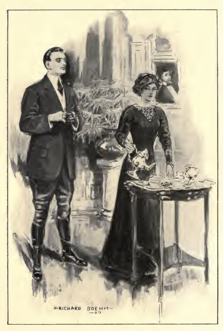
""If it's for me, plenty of tea, very little cream, and three lumps of sugar,' he cried in a gay, ringing voice"